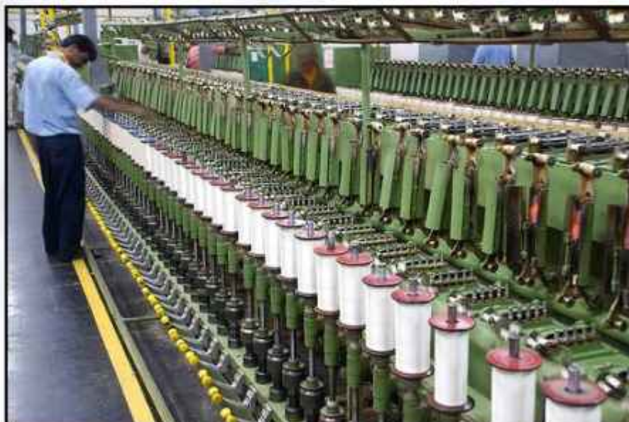
Textile Plant, Ichalkaranji, 32 kms from Kolhapur