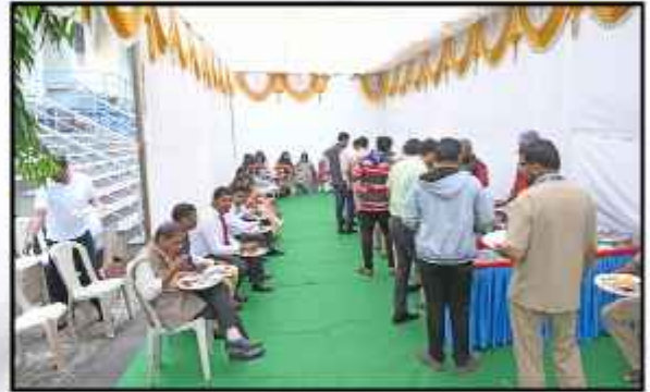
Participants & Staff Enjoying the Delicious Indian Platter