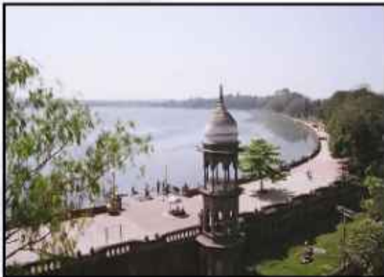
Rankal Lake, Kolhapur