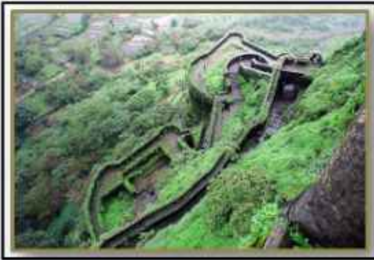
Panhala Fort - 20 kms from Kolhapur