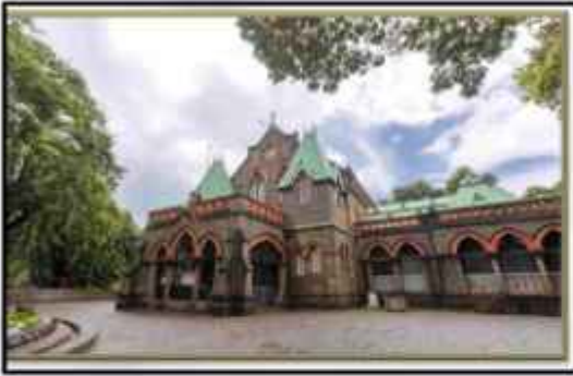
Town Hall Museum, Kolhapur