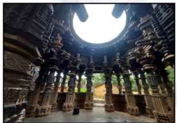
Kopeshwar Temple, Khidrapur 60 kms from Kolhapur