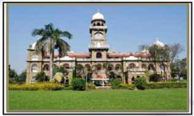
Shalini Palace, Kolhapur