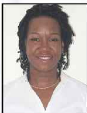
Ede Tyrell College of Medical Sciences, University of Guyana