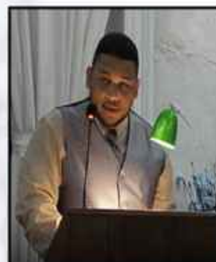
Andrew Hutson College of Medical Sciences, University of Guyana, Georgetown, Guyana