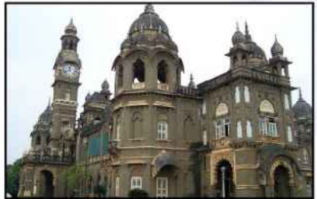
New Palace, Kolhapur