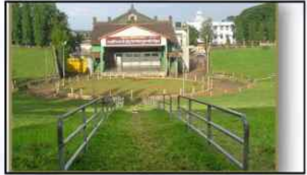
Chhatrapati Shahu Maidan Kolhapur