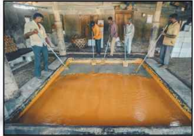
Jaggery Processing Plant