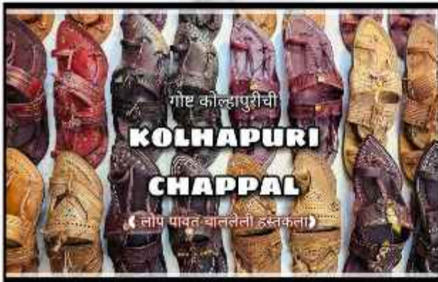
World Famous Kolhapuri Handmade Leather Chhappal