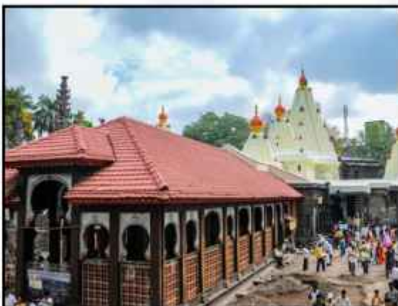
Mahalaxmi Temple, Kolhapur