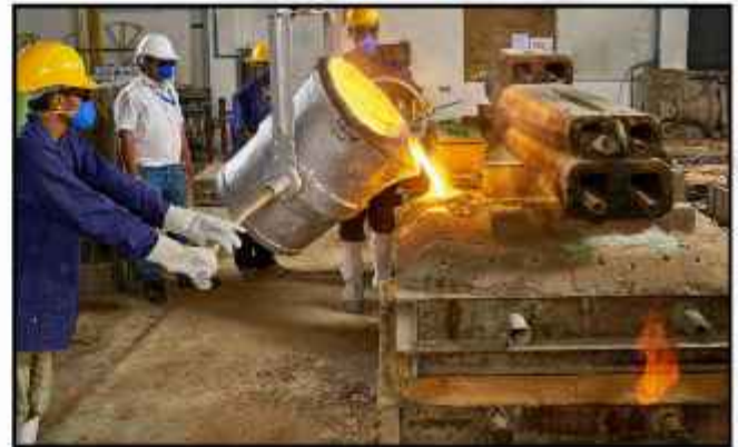
Foundry & Metallurgy Industry