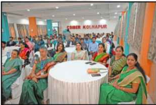
Researchers, Participants, Faculty and Students of International August Gathering